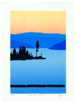
Lake Coeur d'Alene