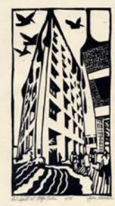
Oil Spill at High Tide