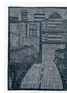
Sunday Early Morning

Printed with Akua Intaglio Lamp Black on Folio White paper. Carved from a single