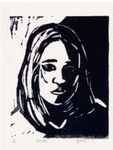
Faith Linocut black oil ink