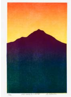
Mt. Hood Sunrise