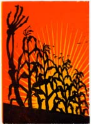
Black Cloud Farm Corn