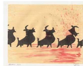
Torque de Gracia Woodblock & hand painted media, two impressions painted on Rives white light

Barbara Patera Seattle Washington USA charlieovershoe@hotmail.com